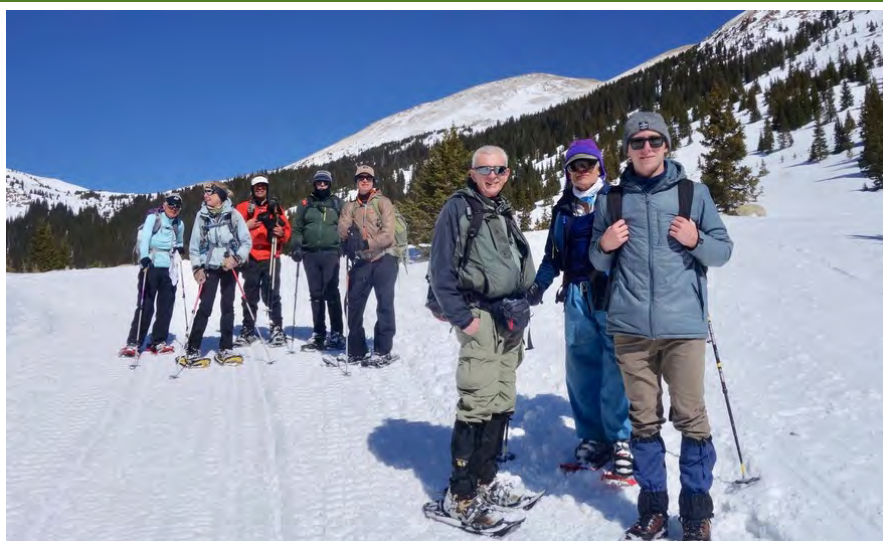
Bobcats at West Clear Creek, Mar 2